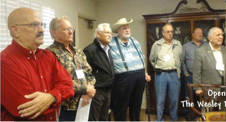
Open House The Wesley Peacock House